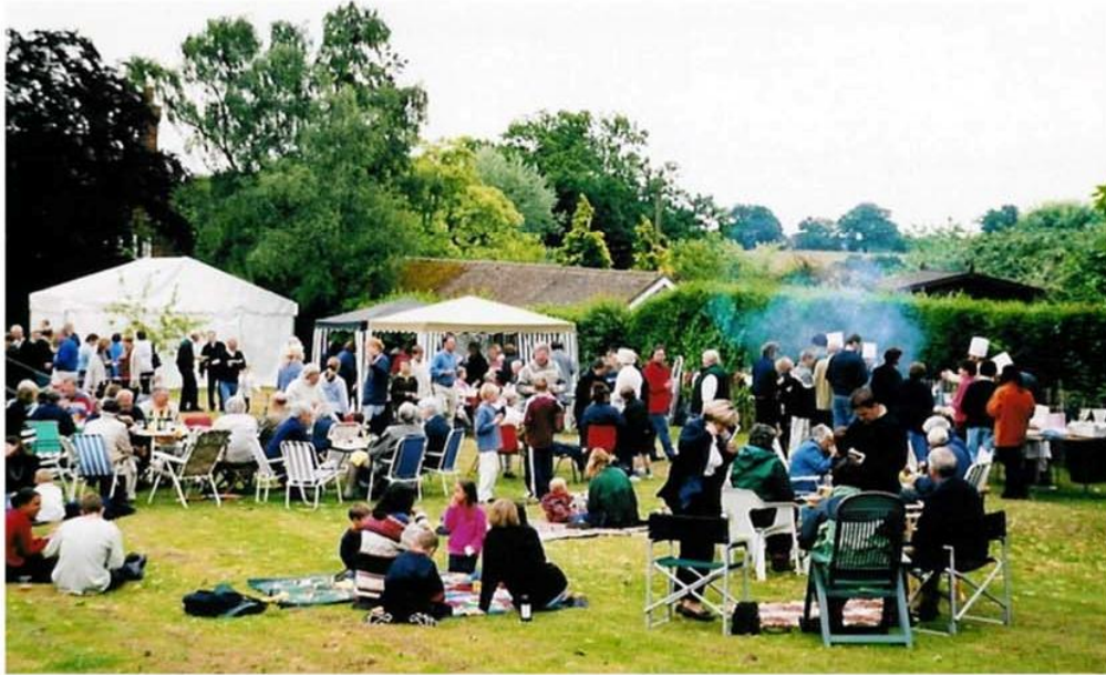
Millennium party, June 2000, & below Cricket in Underriver