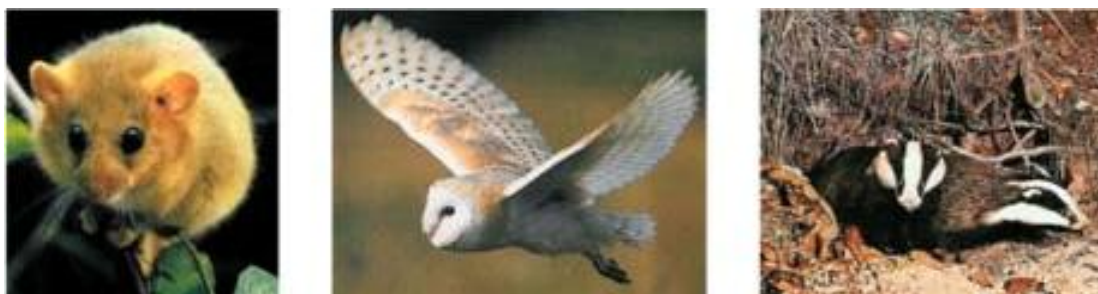
Examples of wildlife found in Underriver

R23. New telecommunications developments, including masts, satellite dishes and other structures should be sensitively designed and sited. Sympathetic design and camouflage should be used to minimise the impact on the environment. A programme to relocate overhead wires underground should be encouraged. Proposals to improve broadband services to the community should be encouraged within the above restraints.