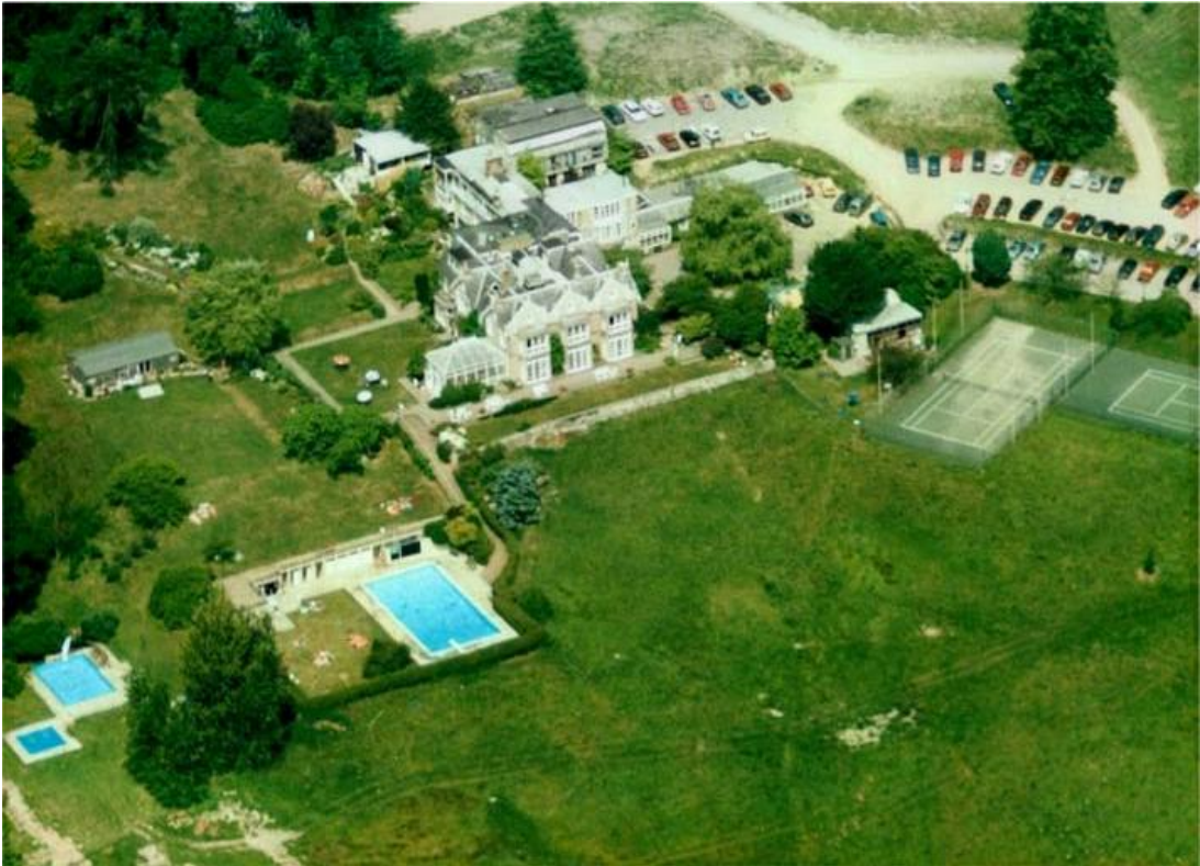
St. Julians club and business complex on the outskirts of the village