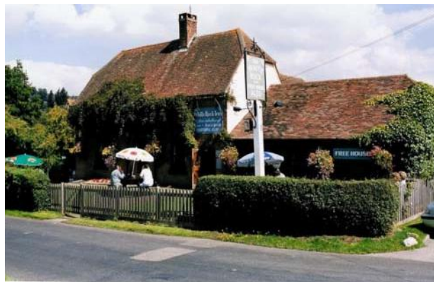
The White Rock Inn and restaurant in the heart of the village

R13. Adequate provision should be made for off-road vehicle parking, which should be screened with native species where appropriate.