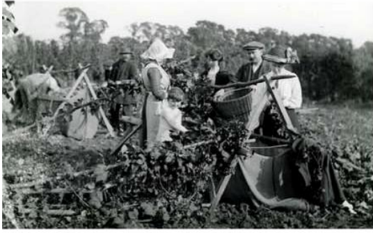
Hop-picking in Underriver pre-1914