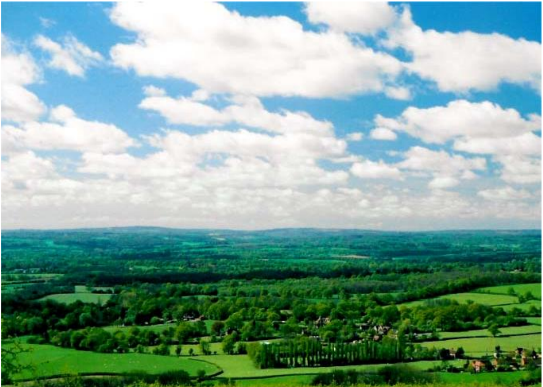
View of Underriver from the Greensand Ridge