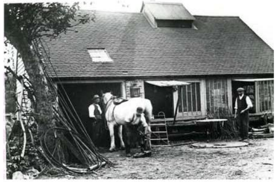
The Underriver Forge pre-1914